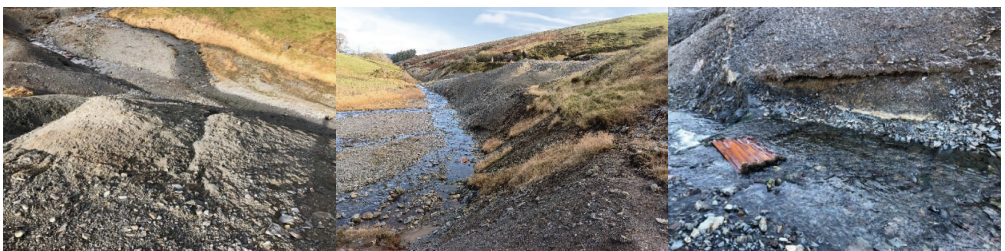
Figure 3, 4 & 5 Afon Twymyn looking downstream eroding Hirnant Tip toe.

Additional erosion protection and drainage will be required to protect the main Hirnant Tip toe and other exposed spoil slopes directly adjacent to the Afon Twymyn. The upstream channel lining work is anticipated to also mitigate the erosion and run-off impacts in those sections. The erosion protection for the Hirnant Tip toe will need to be combined with interception drainage, to prevent hillside run-off infiltrating into the up-gradient spoil deposit and with surface drainage to prevent gullying of the exposed fine grained reprocessed spoil. This will involve reprofiling of the tip to provide separation from the bedrock river channel that can't be moved and to produce a long term stable landform with minimal ongoing maintenance or protection requirements. Alternative options included extensive