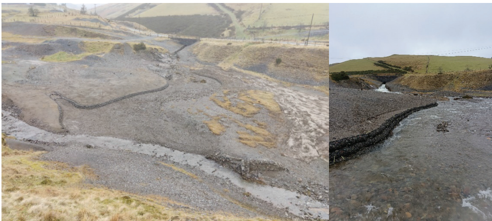
Figure 6 & 7 Erosion Protection Intervention in the Nant Dropyns Channel across the Former Dressing Floor, working in extreme wet conditions.

Spoil deposits sufficiently remote from active watercourses and not representing