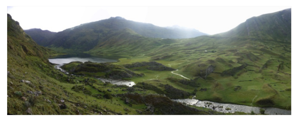
Figure 1 Site location geography.