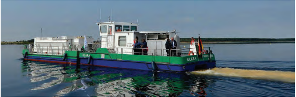
Figure 2 LMBV water treatment vessel Klara during trial operation

water technology. The vessel is a catamaran with two tube mixers mounted between the hulls. This allows additional mixing by the vessel's two propellers at the ends of the twin hulls. The vessel has two lime bunkers, each with a capacity of 12 \text{ m}^3 , allowing material to be bunkered according to the bulk density of the lime.