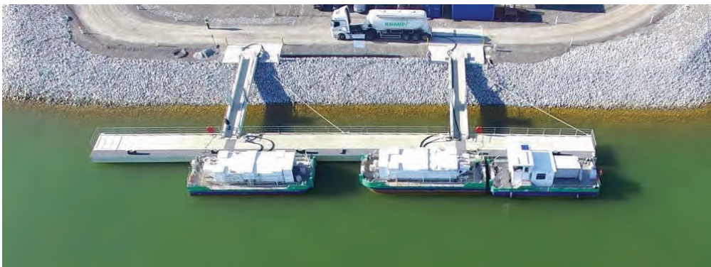
Figure 4 LMBV water treatment vessel Klara (right) coupled to barge 1 (right), barge 2 (left) at the loading site on the Koschendam eastern bank