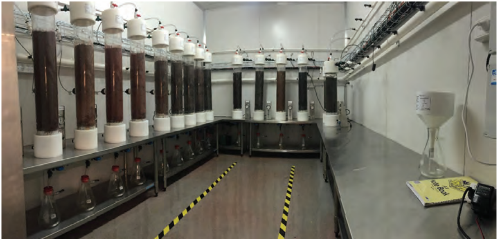
Figure 1 Advanced customisable leachate columns (ACLs).

air flowrates as summarised in Table 1. The range of airflow values were selected to represent different oxygen availabilities inside a WRD, based on the WRD construction methodology, for example, low airflow represents lower WRD lift heights (e.g. less than 5 m to 10 m such that material segregation is reduced and/or density of the material is increased); the intermediate (control) airflow represents higher WRD lift heights where the propensity for material segregation increases and density can decrease; and, the high airflow represents relatively unrestricted oxygen supply.