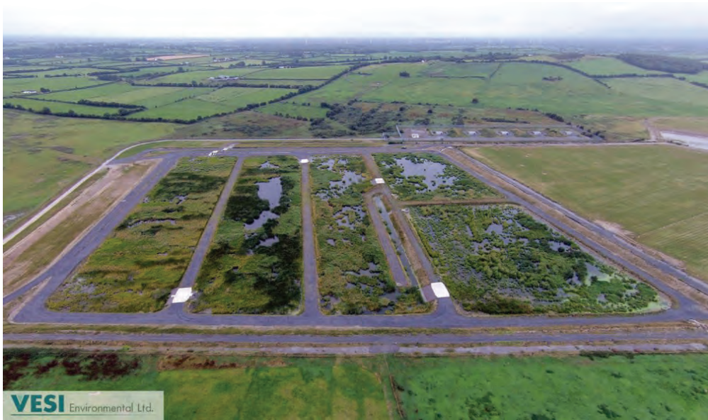
Figure 2 Aerial view of Galmoy Mines constructed wetland (September 2016)