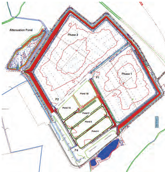
Figure 1 Final layout and design of TMF, wetland, and attenuation to licensed discharge (oriented North)

The remediation of partially filled Phase 3 (8.29 Ha) presented an additional challenge in the closure process. Approval was received from the authorities to redesign TMF Phase 3 and develop an integrated constructed wetland (ICW) on the surface area of the partially filled Phase 3 (Figure 1). The innovative location of the ICW within Phase 3, was designed to reduce the footprint of the tailings runoff area and remediate Phase 3 simultaneously. The deposited tails in Phase 3 required resurfacing before the ICW could be constructed on the capped surface. Designed by Golder Associates (2011), Phase 3 was capped with glacial till and HDPE liner derived from the reduction in the height of the dam wall of the partially filled Phase 3. Based on the trial data in 2009, Vesi Environmental Ltd., developed the ICW to treat surface runoff water reporting from remediated Phase 1 (P1) and Phase 2 (P2).