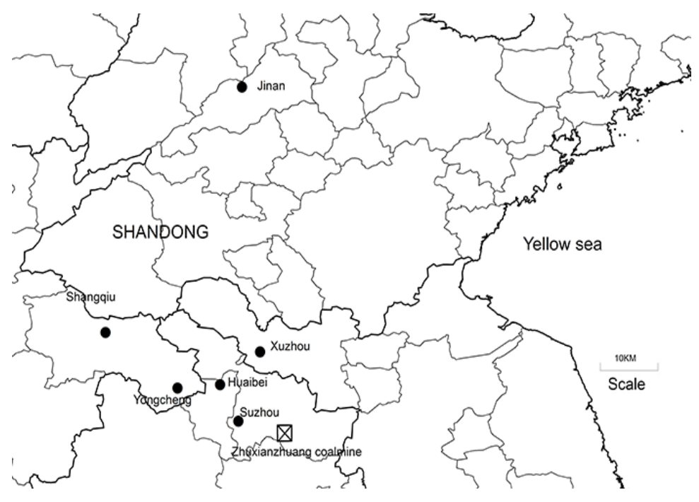
Figure 2 The location of the Zhuxianzhuang Coalmine

average thickness of 10.03 m. There aquifers and aquiclude in the Cenozoic are is formed multi-layer composite structure due to the interactive deposition. The first, second, third, fourth aquifers in the Cenozoic, the fifth aquifers in the Jurassic, karst fractured aquifer in the Carboniferous and Ordovician respectively are mainly aquifers in the coalmine, as shown in Figure 3.