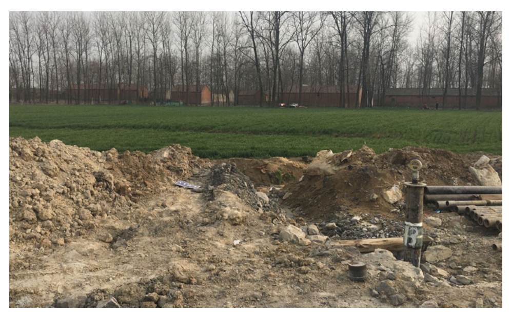
Figure 5 The surface around the grouting drilled