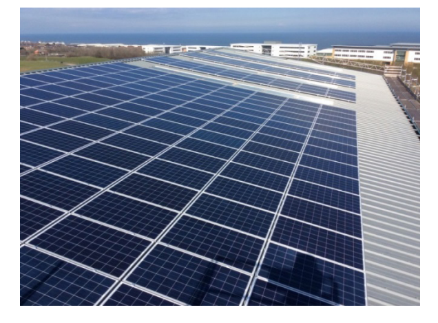
Figure 2 Photograph of the installed solar PV array at the Dawdon mine water treatment plant.