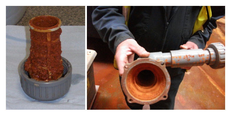
Figure 3 Blocked strainer filter on mine water feed to heat exchanger (left) and ochreous deposits on the heat exchanger inlet (right).

Initially, the heat pump was installed with a heat exchanger to extract heat from the treated mine water prior to discharge, however despite the low Fe levels in the treated water (<1 mg/l, total Fe) significant ochre accretion on system filters and pipework (Figure 3) was observed that resulted in reduced flow, impaired performance (Bailey, Moorhouse and Watson 2013) and increased maintenance requirements.