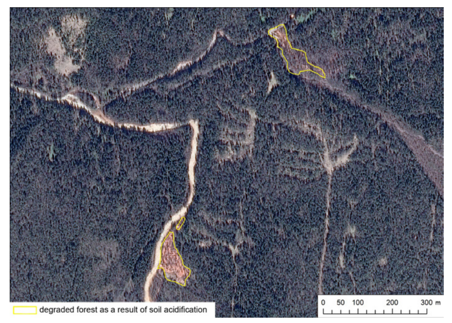
Figure 3 Areas of forest degradation as a result of acid drainage seeping from mine shafts in the Sev. Vil'va River valley