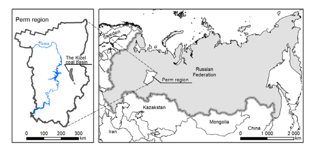
Figure 1 Location of the Kizel coal basin (a, Russian Federation, b, Perm region)

The national environmental monitoring program adopted for the area of the Kizel coal basin includes collection of water samples from acid mine drainage zones and polluted rivers. Data on land degradation and variations in pollution levels are not available. The results of the national monitoring program did not allow reliable determination of the extent of pollution and identification of secondary pollution sources in order to locate potential areas for land reclamation. The developed GIS is designed to solve the following tasks.