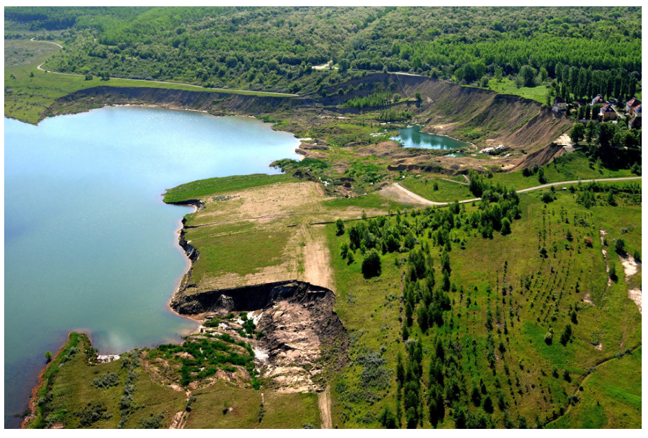
Figure 1 Aerial view of the 2009 landslide Nachterstedt

This paper discusses the development of a geological structure model starting with the basic information such as borehole data and on base of the geological model the establishment of a groundwater model. It indicates the significance of the iterative interactions between the field geologists (basic information/borehole data), the geological modellers (geological structure model) and the groundwater modeller (groundwater flow model) to face difficulties and uncertainties during the modelling workflow and to provide a consistent geological model and hydrogeological model in the cause study of the mentioned landslide. It is exemplarily shown, that this iterative modelling workflow should be considered instead of the classic "in sequence" modelling workflow especially in complex geological and hydrogeological settings with high requirements on the models.