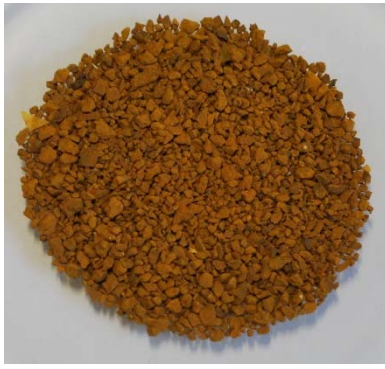
Figure 1 SHM sorpP

SHM-sorpP (fig. 1) was fabricated by high pressure compaction of the schwertmannite from the pilot plant. Details of the high pressure compaction are given in EU patent application EP2664376A1. The adsorption properties relating to the different oxoanions of the new SHM-based adsorbent should be compared to a commercially available iron hydroxide adsorbent like Ferrosorp®Pus (HeGo Biotec GmbH).