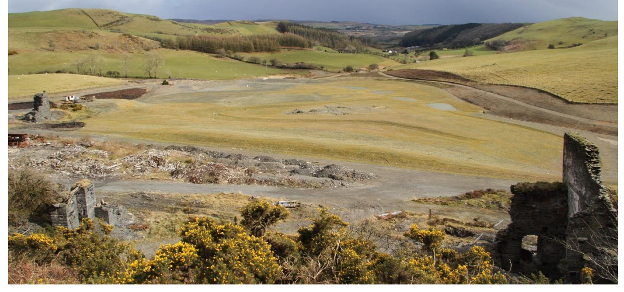
Figure 3 Photo of Frongoch Mine looking from north west to south east in April 2016.

A desk-study of the mine's industrial heritage, undertaken during the scoping exercise, divided the site into zones according to archaeological potential (Murphy 2012). This study informed the design of the remediation scheme, which avoided the SAM and a number of unscheduled building remains in the centre of the site. EAW excavated six archaeological trenches in August 2012, which were evaluated to identify buried remains across the site, create a deposit model clarifying the extent of overburden protecting these sites and identify areas in which structures were likely to be disturbed by the proposed works. Features of interest included the well-preserved remains of two buddle-pits, several wall-lines, tram rails, tramway banks, a reservoir bank and timber structures. The depth of these features varied from 0.2m to 1m below existing ground levels (Poucher 2012).