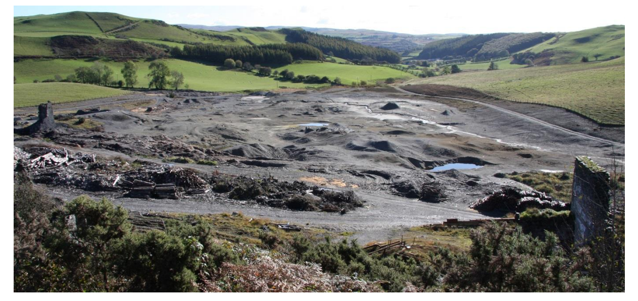
Figure 2 Photo of Frongoch Mine looking from north west to south east in October 2010.