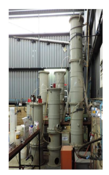
Figure 2 Multi-stage column system used for test work

Figure 3 gives the results of sequential precipitation of the water from a Finnish Gold mine. It gives a clear indication of the optimal pH for precipitation (10.5) and further analysis of the generated sludge (10.5). Detailed chemical analysis of the generated solids will form the base for developing the valorisation concepts. The generated solids contain little base metals but the minerals of potential industrial value are magnesium and manganese.