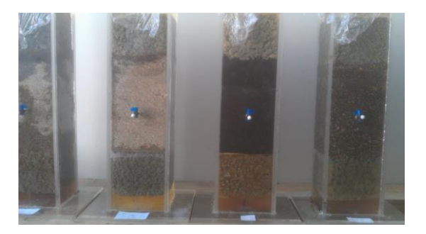
Figure 1 Short term experimental rigs in operation

Filters for the first phase were constructed out of Perspex sheets and were rectangular with an internal dimension of 105mm in order to accommodate a standard 100x100x100mm concrete cube and have a length of 450mm in order to allow for sufficient space for two concrete cubes and a 200mm thick composting layer in between them. The experimental rigs were placed vertically and AMD was passed through the filter under gravitational force. The base plate as well as the midpoint of the filter has a nozzle to allow samples to be taken during filtration. An example of the phase one setup can be seen in Figure 1.