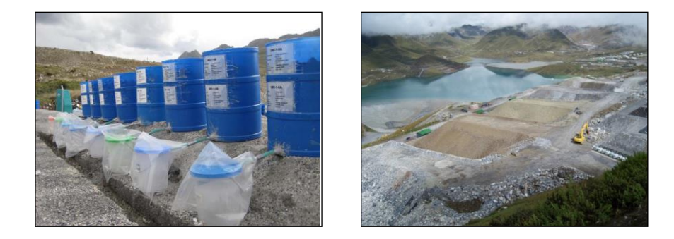
Figure 1 Experimental field barrels, 1m high and containing ~350 kg of waste rock (left); and experimental waste rock dumps, 10m high and containing ~30,000 kg of waste rock (right) at Antamina.

various locations in the open pit were also sampled for isotope analysis because it is the chemical weathering of these minerals which is expected to be the dominant source of Mo and Zn in waste rock drainage waters.