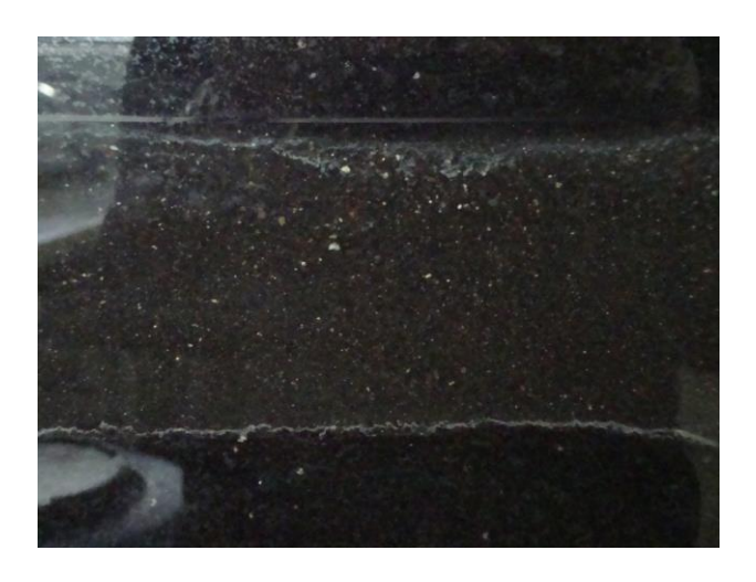
Figure 4 Location of precipitates along layer boundaries. The darker is the organic layer

Figure 4 shows white precipitates along the boundaries between layers, consistent with gradient-based resistance.