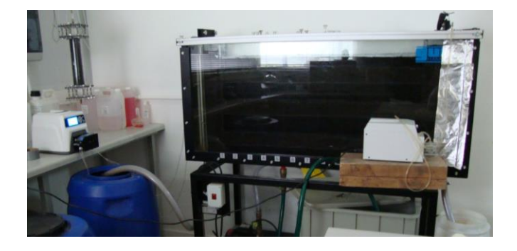
Figure 1 Experimental system

Finally, after 3 months, the possibility of rejuvenating spent organic layers was tested. A solution of 20 g/L of microcrystalline cellulose (MCC) (Sigmacell, 20 \mu m) was injected into reactive layers at 5– cm intervals (27 g of MCC in total).