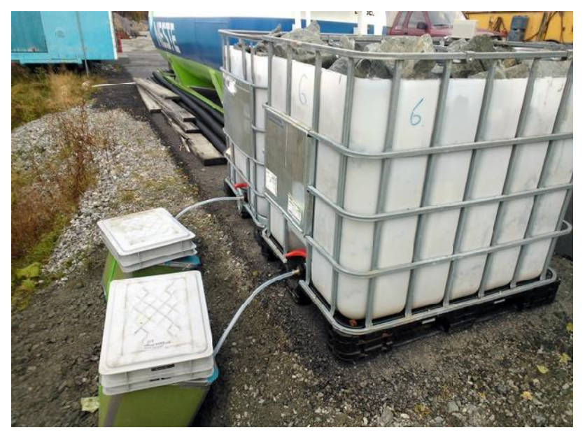
Figure 2 The aging test units 1 (front) and 2 (behind). The rain water flowing through the units was collected in the green plastic tanks below.