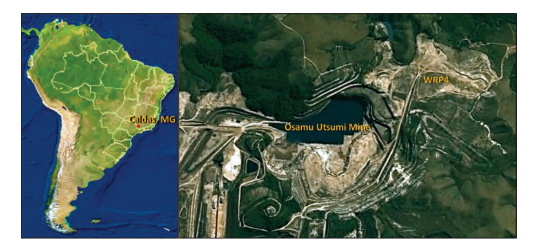
Figure 1 Location of Caldas City at Minas Gerais, Brazil (left). Partial view of the Uranium Exploration Site with emphasis on Osamu Utsumi Mine and Waste Rock Pile 4 (WRP4) (right).

1700mm, with over 120 rainy days each year (Holmes et al. 1990; Schroscher & Shea, 1991).