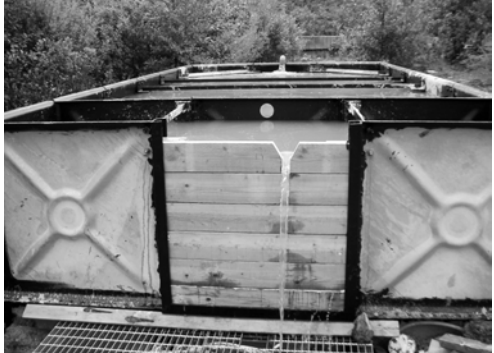
Figure 3 Photographs of large pilot-scale system at Taff Merthyr